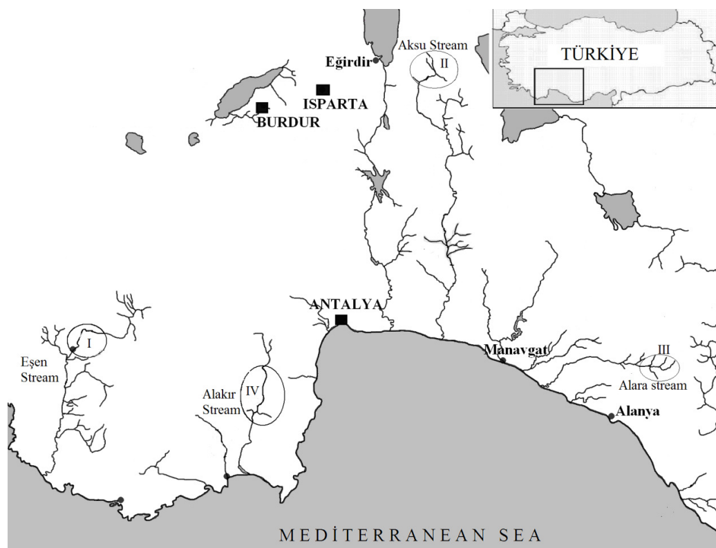
Figure 1: Natural mountain trout specimens were caught in locality (Eşen I: 36.771914°N - 29.407618°E, Aksu II: 37.826410°N - 31.112606°E, Alara III: 36.762420°N - 32.144814°E, and Alakır IV: 36.546430°N - 30.288160°E streams)