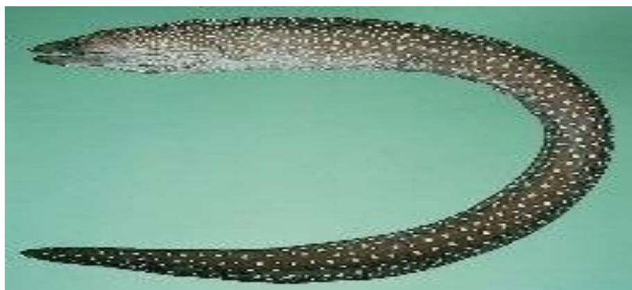
Figure 4: Gymnothorax johnsoni Ref. code: O- E, (Owfi and Abbasi, 2007)