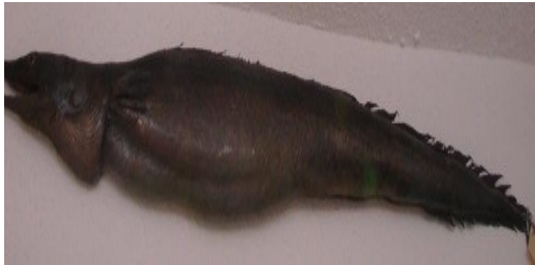
Figure 5: Synphobranchius affinis Ref. code: K, (Owfi and Abbasi, 2007)

Collected from Kish Island in coralline rocky habitats (Persian Gulf) and kept in Darabad Museum (Ref. code: K), without scientific and museum codes (Tables 1, 2; Fig. 5).