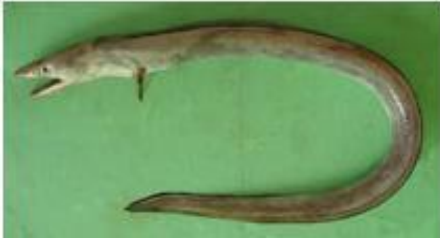
Figure3: Muraenesox Bagio Ref. code: E, (Owfi and Abbasi, 2007)

Muraenidae: Included 15 genera and 200 species, and 5 genera and 8 species identified from Muraninae subfamily.