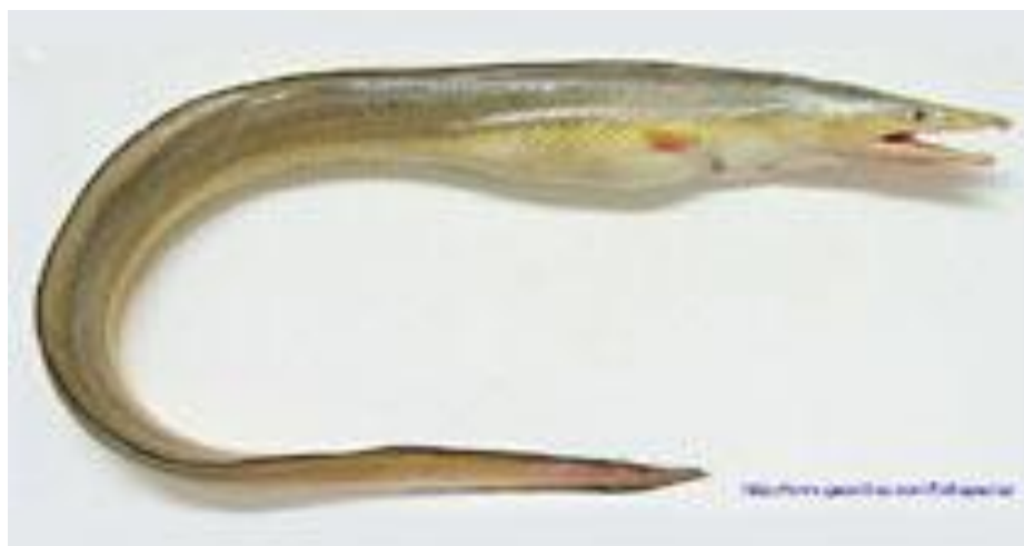
Figure 2: Conger esox talabonoides Ref. code: P, (Chau, 2003)

This sample collected from Meidani (Oman Sea) and Kept in Tehran University Zoology Museum (Ref. code: P), without scientific and museum codes (Tables 1, 2; Fig. 2).